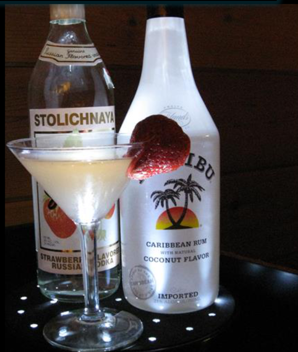
Strawberry Love Potion

CASH BAR REQUIRES 60 DAY MINIMUM NOTICE TO APPLY FOR LICENSE FROM LOCAL & STATE AUTHORITIES. ADDITIONAL $600.00++ FEE REQUIRED FOR LICENSE & INSURANCE (not required at Brenton Plaza or the Iowa Arboretum).